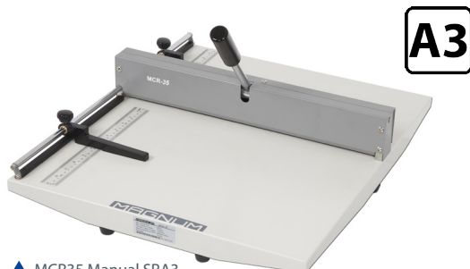
▲ MCR35 Manual SRA3