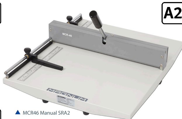
▲ MCR46 Manual SRA2