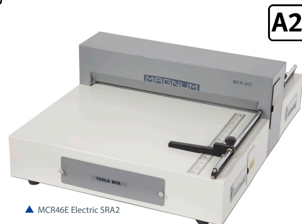
▲ MCR46E Electric SRA2