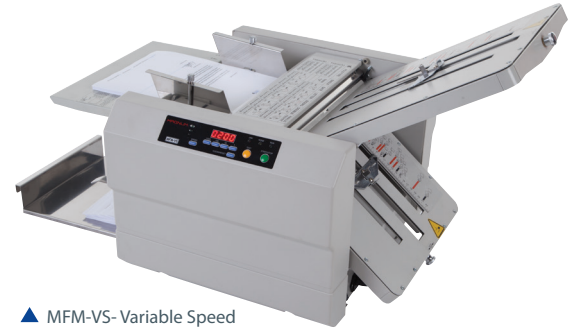
▲ MFM-VS- Variable Speed