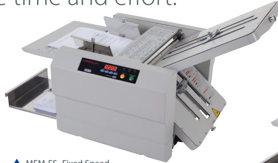
▲ MFM-FS- Fixed Speed

The Magnum range of electric folding systems help to save time and effort.