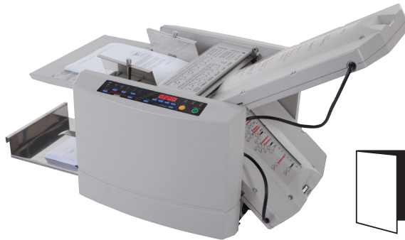
▲ MFM-PS- Programmable