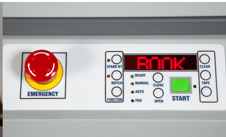
User-friendly control panel