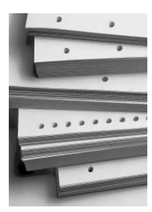
Any pattern of holes can be punched without effort.